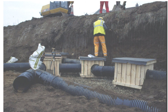
Above: plan of a medium size Type 1 Design artificial sett. Right: Type 1 Design artificial sett under construction, A97, Aberchirder, Scotland (Grampian Badger Surveys for Aberdeenshire Council 2000).